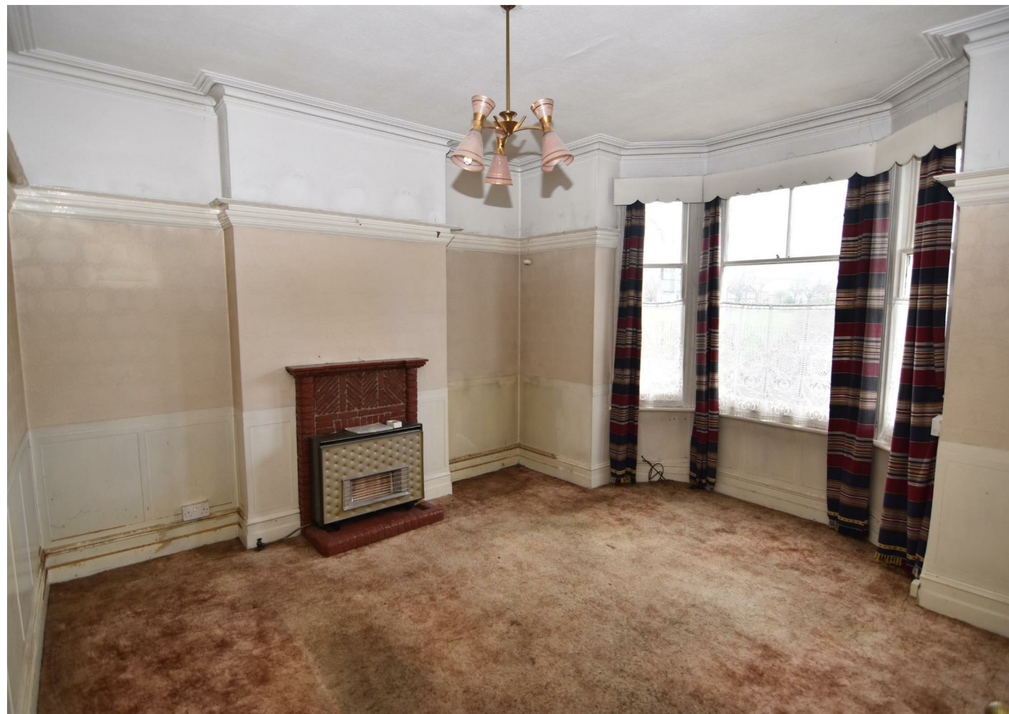
A Substantial four bedroom Edwardian residence situated opposite the open spaces of Fairfield Green.

A substantial Edwardian halls adjoining semi-detached house situated in the sought after Fairfield area directly opposite the pleasant open spaces of Fairfield Park, ideally located for Kingston town centre. The property is in need of modernisation and has retained many original features and the accommodation currently comprises: four bedrooms, bathroom, three reception rooms, Cloak/Wet r room and a kitchen. To the rear of the property there is a 40ft rear garden.